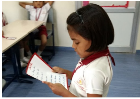
STAR OF THE WEEK