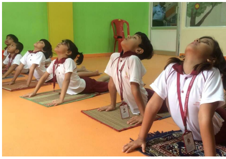
YOGA FOR HEALTH