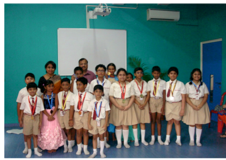
UCMAS NAT WINNERS