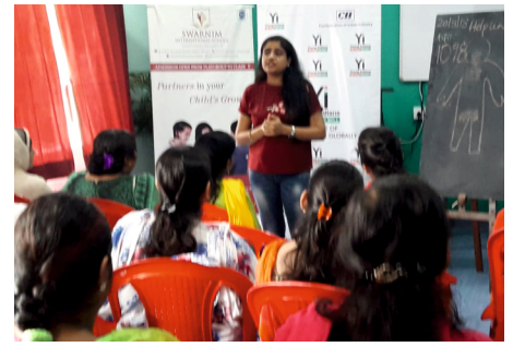
GOOD TOUCH BAD TOUCH