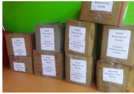
KERELA RELIEF MATERIAL