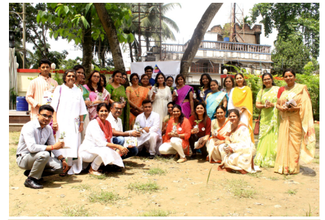
TREE PLANTING WITH TEMPLE OF INNER WISDOM