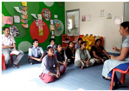
WORKSHOP FOR HELPERS