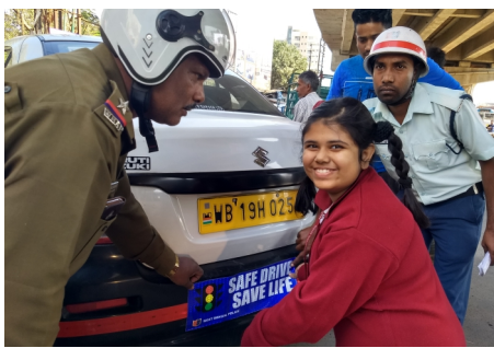
SAFE DRIVE SAVE LIFE