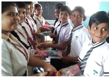
SPREADING SMILES ON CHILDRENS DAY