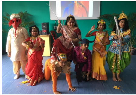
DURGA PUJA CELEBRATION