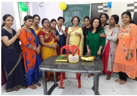
SWAR - SPOKEN ENGLISH CLASSES