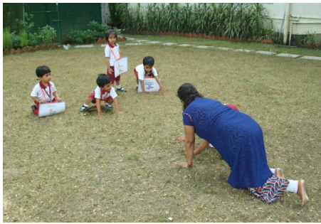
OUTDOOR CLASSROOM DAY