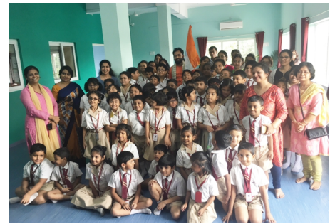
FOOT SOLDIER VISIT