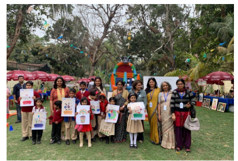
GARBAGE FREE INDIA