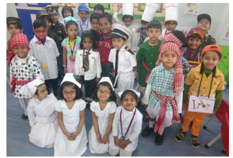
FANCY DRESS COMPETITION