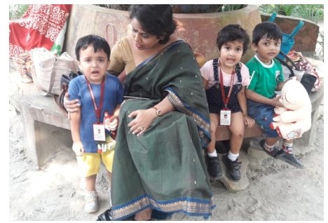
PICNIC ON CHILDRENS DAY