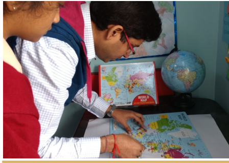
STUDENT LED CONFERENCE