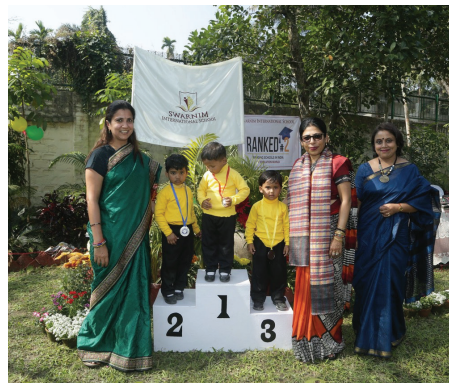
ANNUAL SPORTS DAY 2020