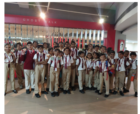
VISIT TO SCIENCE CITY - CLASSES 3 TO 6