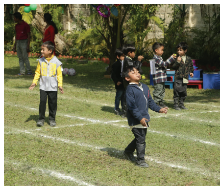
ANNUAL SPORTS DAY 2020