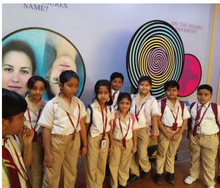
Visit to Science City - Classes 1 & 2