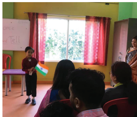
SHOW & TELL