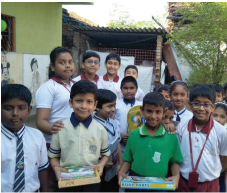
SPREADING SMILES AT JMS