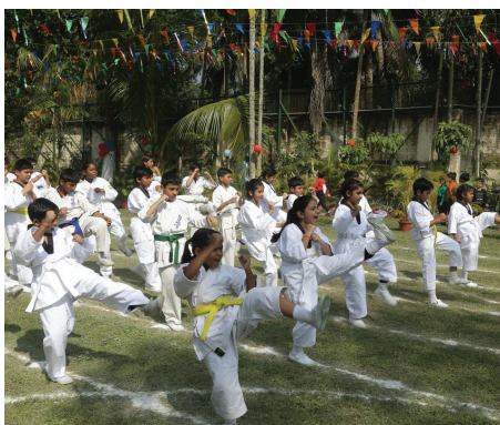
ANNUAL SPORTS DAY 2020