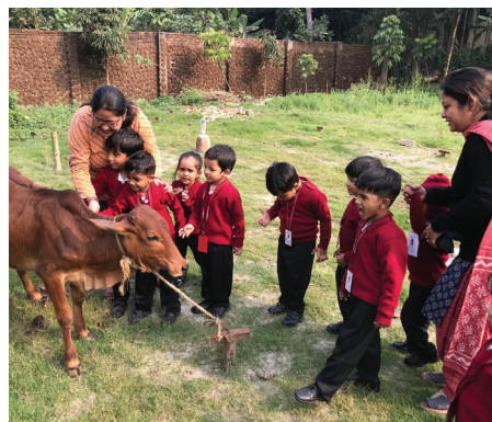
FARM VISIT (PRE-PRIMARY)