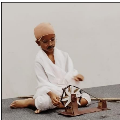
GANDHI JAYANTI CELEBRATION