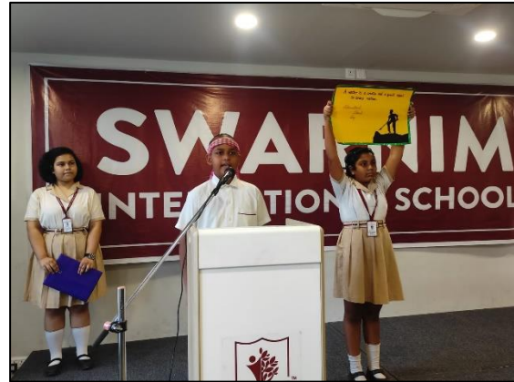
LABOUR DAY ASSEMBLY