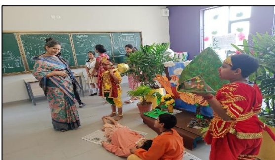
MONTAGE- ANNUAL EXHIBITION