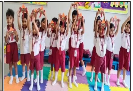
VISHWAKARMA PUJA ACTIVITY