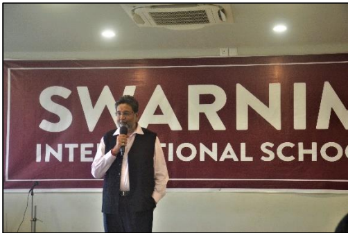
VISIT OF PADMASHREE HARSHAVARDHAN NEOTIA