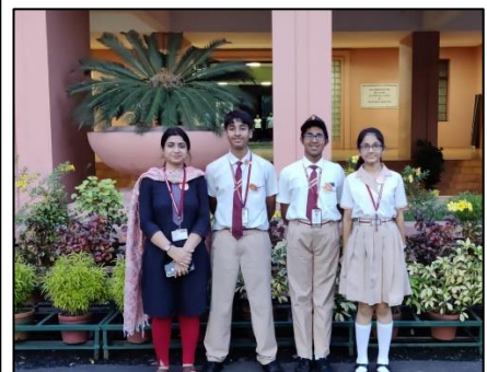
STEM ON WHEELS- VISIT TO IIT KHARAGPUR