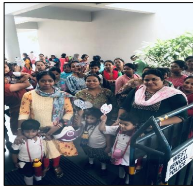
MOTHER'S DAY CELEBRATION