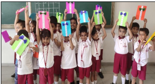
FATHER'S DAY CELEBRATION