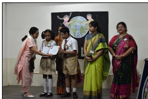
INTER-SCHOOL SCIENCE EXHIBITION- AVISHKAR