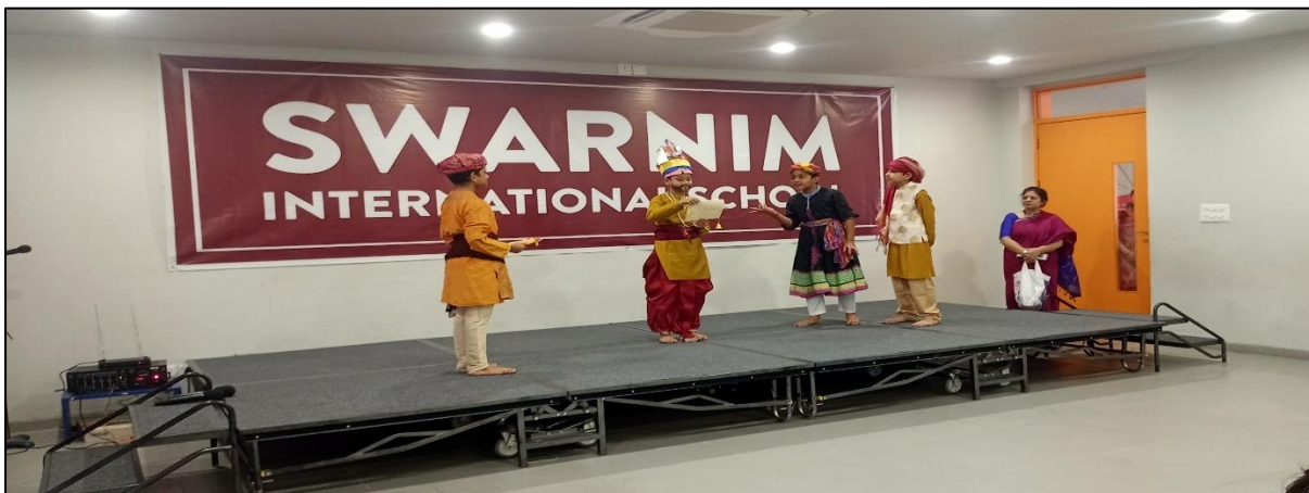
RAKHI SPECIAL ASSEMBLY: DRAMA "RAKHI KA MULYA"