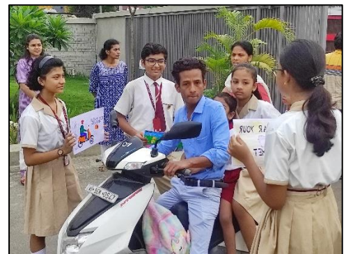
CATCH CLUB ACTIVITY: WEAR HELMETS