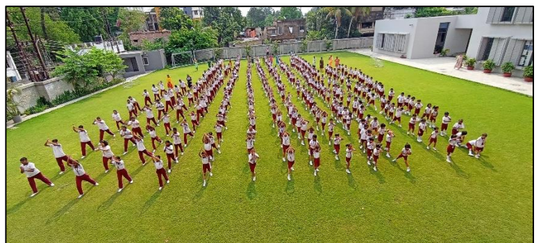
INTERNATIONAL YOGA DAY