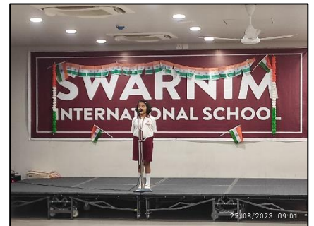
INTER-HOUSE ELOCUTION COMPETITION