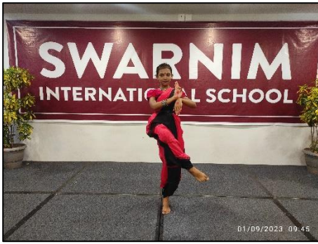
INTER-HOUSE DANCE COMPETITION

"You can teach a student a lesson for a day; but if you can teach him to learn by creating curiosity, he will continue the learning process as long as he lives."- Clay P. Bedford