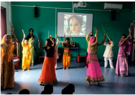
DURGA PUJA CELEBRATION