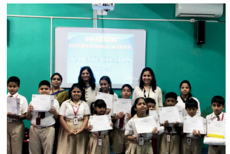
KARATE YELLOW BELT