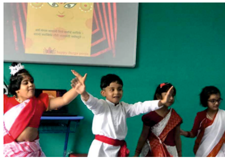
BENGALI NEW YEAR