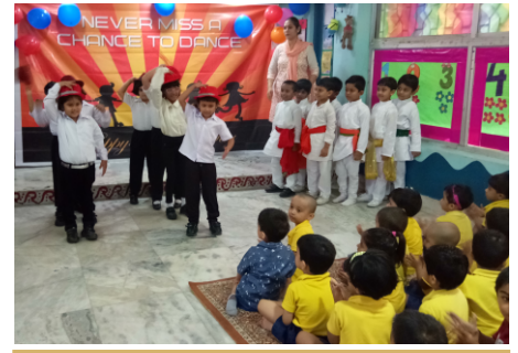
WORLD DANCE DAY